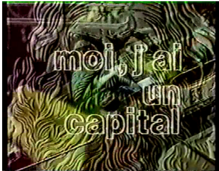
Film still of Le Rapport Darty by Jean Luc Godard & Anne-Marie Miéville, 1989